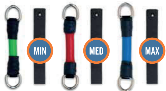
2: Bounders Dorsi Stop