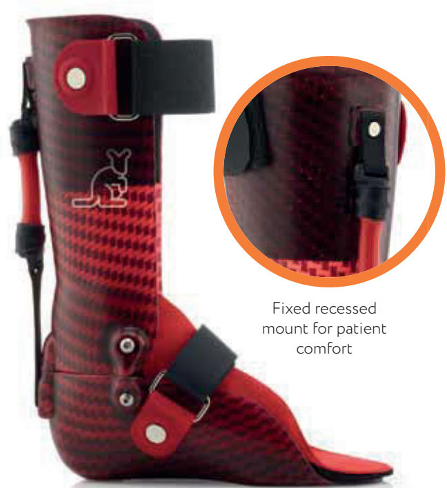
1: Bounders Free Range

No tools for on the fly adjustments by healthcare providers