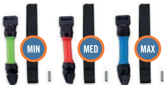
1: Bounders Free Range

a ground reaction force. Smart and simple modular design, standardized sizes and three levels of performance to choose from add up to an easy to use expandable dynamic system to treat your pediatric and young adult patient base.