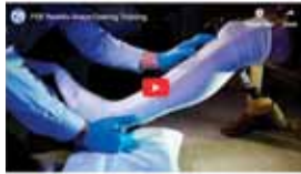
YouTube > PDE Reaktiv Brace Casting Training